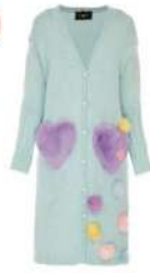
CARDIGANS "MINT CONFETTI" CARDIGAN $450 $325