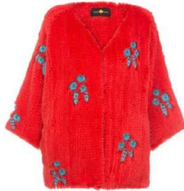
FUR COATS RED MINK FUR COAT " BEADED FLOWERS"