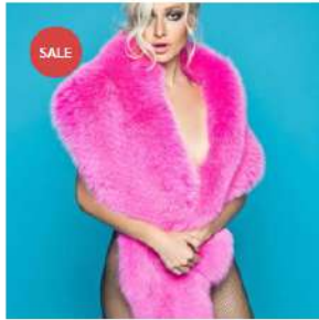
SCARVES & HATS "PINK CLOUD" SCARF $1,200 $650