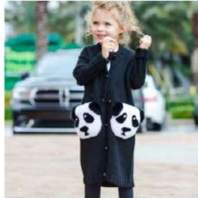
KIDS "PANDA CARDIGAN" KIDS $450