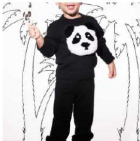
KIDS "PANDA TRACKSUIT" KIDS $350